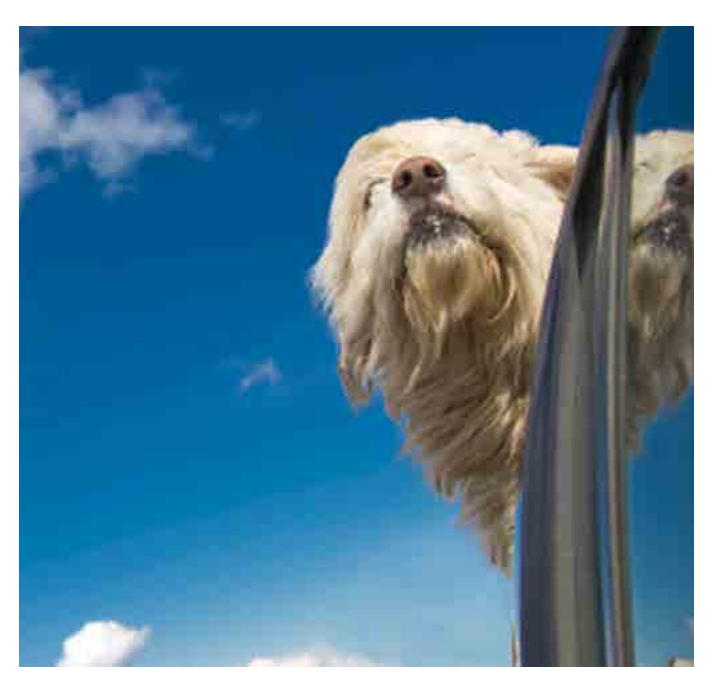
Animal Welfare Foundation

YOUR GUIDE TO DISEASES ENCOUNTERED ABROAD